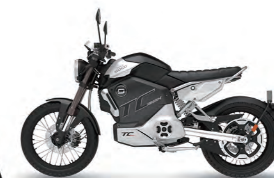
Spoke Wheel Version