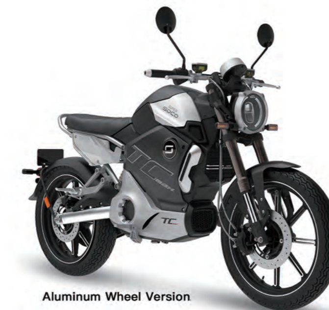
Aluminum Wheel Version

* The data come from the corporate laboratory tests in ideal conditions and all data are for reference only.